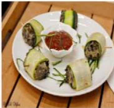
The Saboro Lounge is a great place to enjoy a healthy meal. The food is fresh and delicious, and the atmosphere is relaxed and comfortable.