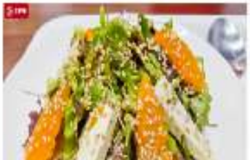
The Saboro Lounge is a great place to enjoy a healthy meal. The salad is fresh and delicious, and the atmosphere is relaxed and comfortable.